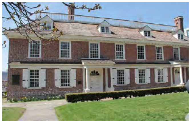
Philipse Manor Hall State Historic Site is a historic house museum located in the Getty Square neighborhood of Yonkers, New York. Originally the family seat of Philipse Manor, it is Westchester County's second oldest standing building after the Timothy Knapp House.