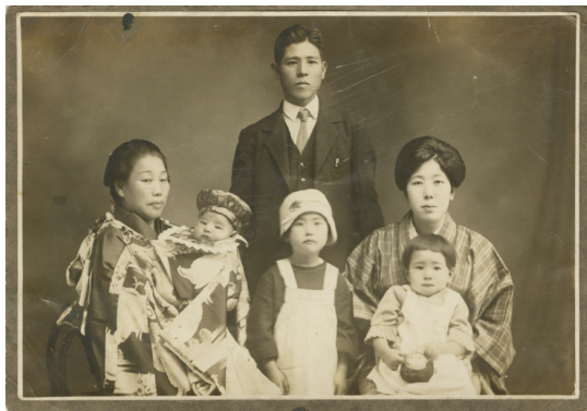
Exhibit Opening Event: May 7 from 12-4pm, Sahyun Library

Learn about the incredible stories of Santa Barbara's Asian American and Pacific Islander families, industries, churches, and military. We will also have booths from partner organizations, live Japanese tone chime songs, bonsai demonstrations, Chinese tea service, appetizers, and more!