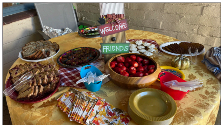
Beautiful and delicious welcome to visitors on Family History Month Open House, October 2, 2022