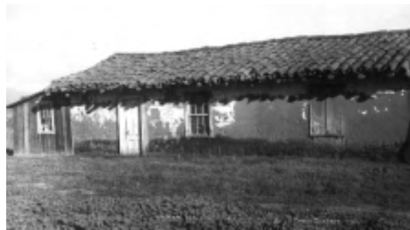
AN OLD SANTA BARBARA ADOBE

Continued from Vol. 27, No. 4, Summer 2001