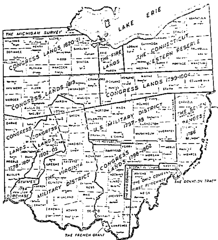
Principal Land Subdivisions Imposed on Present Map of Ohio