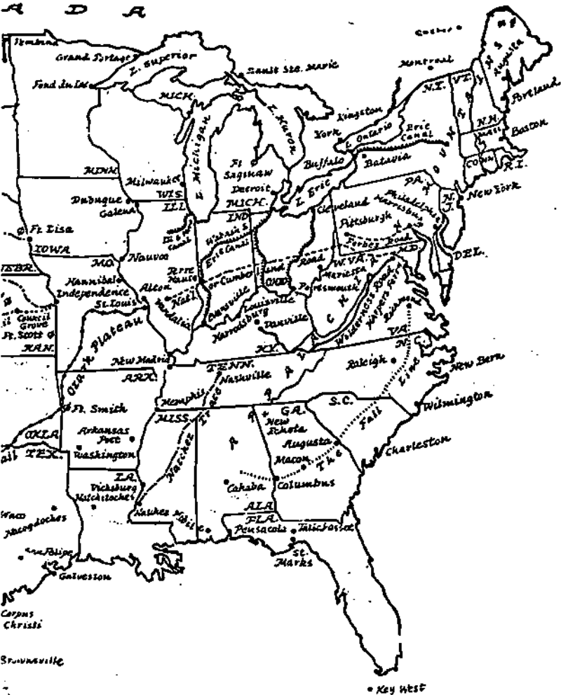
Early routes to the West