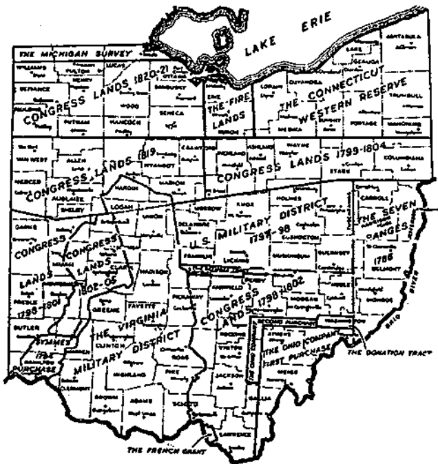
Principal Land Subdivisions Imposed on Present Map of Ohio