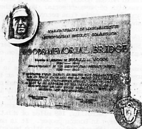
Plaque on Memorial Bridge, Malden-Medford