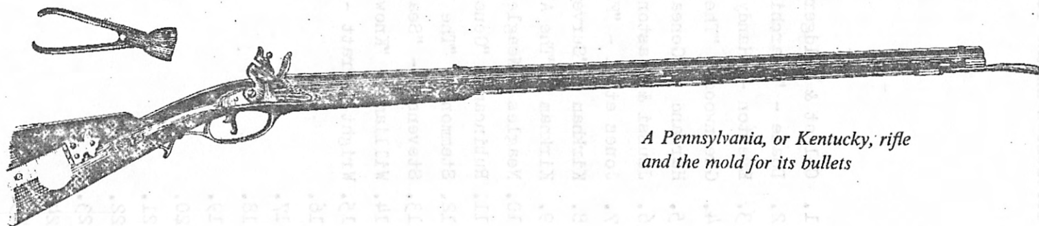
A Pennsylvania, or Kentucky, rifle and the mold for its bullets